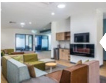
David Martin Place

Thanks to your generous support, DMP was officially opened on June 2nd 2017 . This is a youth drug and alcohol detox facility that helps 16-24 year olds to overcome addiction and lead healthy lives. It is the first detox facility of its kind in New South Wales.