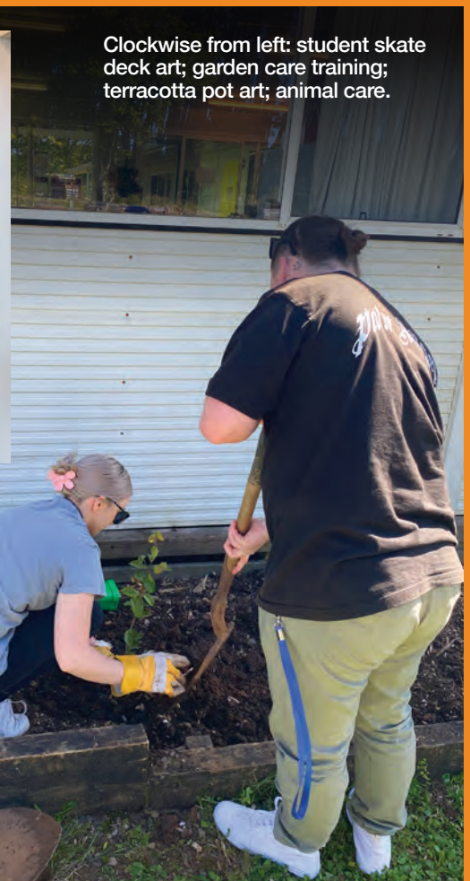
Clockwise from left: student skate deck art; garden care training; terracotta pot art; animal care.