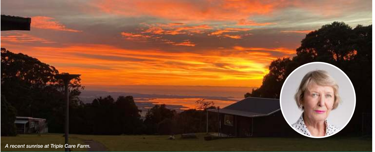
A recent sunrise at Triple Care Farm.