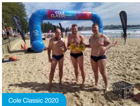
Cole Classic 2020

Get in touch with our team at admin@martinfoundation.org.au or (02) 9219 2002 and we'll help get you started.