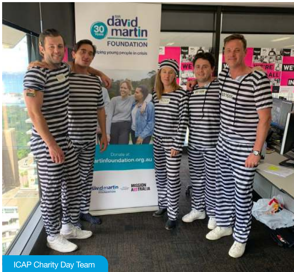
ICAP Charity Day Team

Each year we are so thrilled to have supporters raising money for our Foundation through a range of exciting individual, community and workplace events. So far this year we have individuals taking on the Cole Classic Ocean Swim in Manly (Feb 2022) and the Sydney Half Marathon (May 2022) and directing their fundraising dollars our way. We were also so grateful to be an Australian recipient of the recent